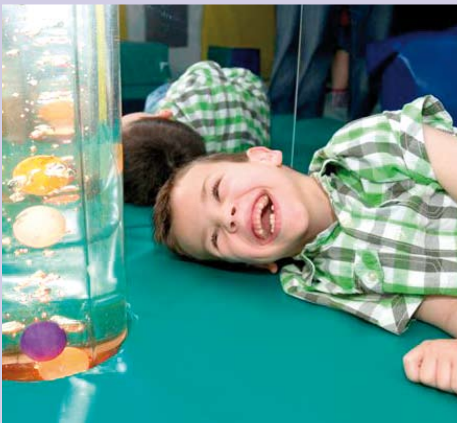
A child enjoys his first experience in the new sensory room at Chancet Wood Residential Unit.

If you would like more information about any of the short breaks available in Sheffield, including the grants scheme, please contact SIGN on (0114) 266 9476 .