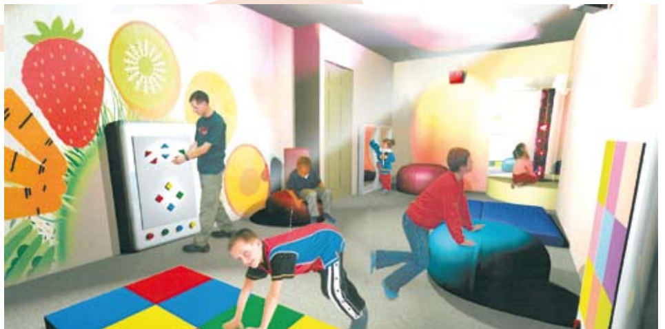
An artist's impression of the new sensory room at sensory Concorde

This was previously the site of a disused hydrotherapy pool, which was